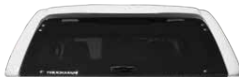
GLASS DOOR (Standard option on RS)