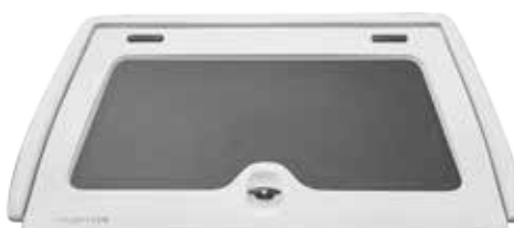
GLASS DOOR WITH SOLID METAL SECURITY PANEL