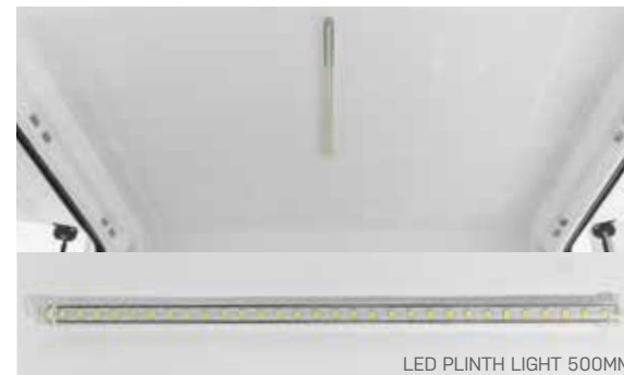
LED PLINTH LIGHT 500MM