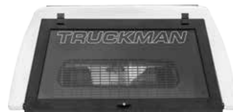
GLASS DOOR WITH SECURITY GRILL