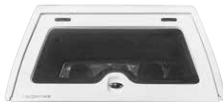
TINTED GLASS DOOR