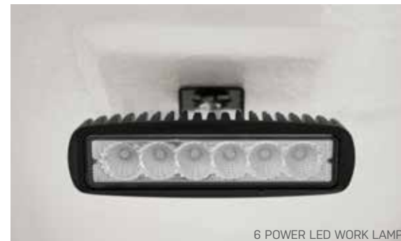
6 POWER LED WORK LAMP

Improve the visibility of your work area with the aid of interior lighting. With automatic or manual options available.