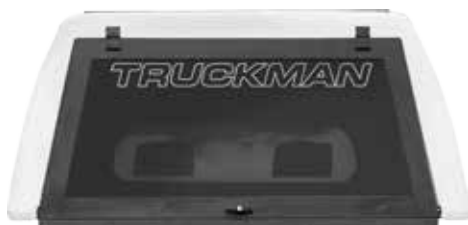
GLASS DOOR (Standard option on Classic)