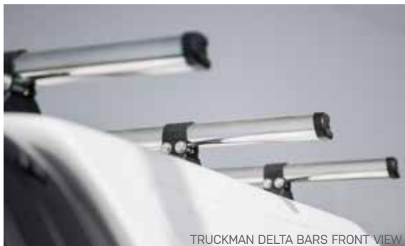
TRUCKMAN DELTA BARS FRONT VIEW

Increase the carrying capacity of your commercial truck with the Truckman Delta Roof Bars. Ideal for carrying ladders, pipes and so much more.