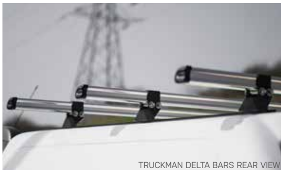
TRUCKMAN DELTA BARS REAR VIEW