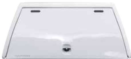
SOLID DOOR (Standard option on Utility)