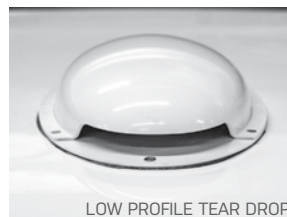
LOW PROFILE TEAR DROP