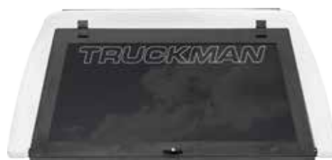
GLASS DOOR WITH SOLID METAL SECURITY PANEL