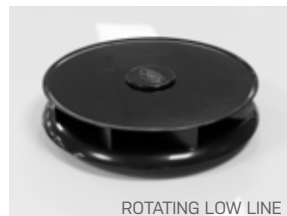
ROTATING LOW LINE