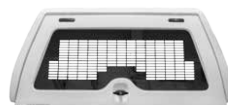
GLASS DOOR WITH SECURITY GRILL