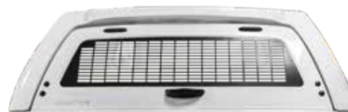
OPEN METAL GRILL (no glass)