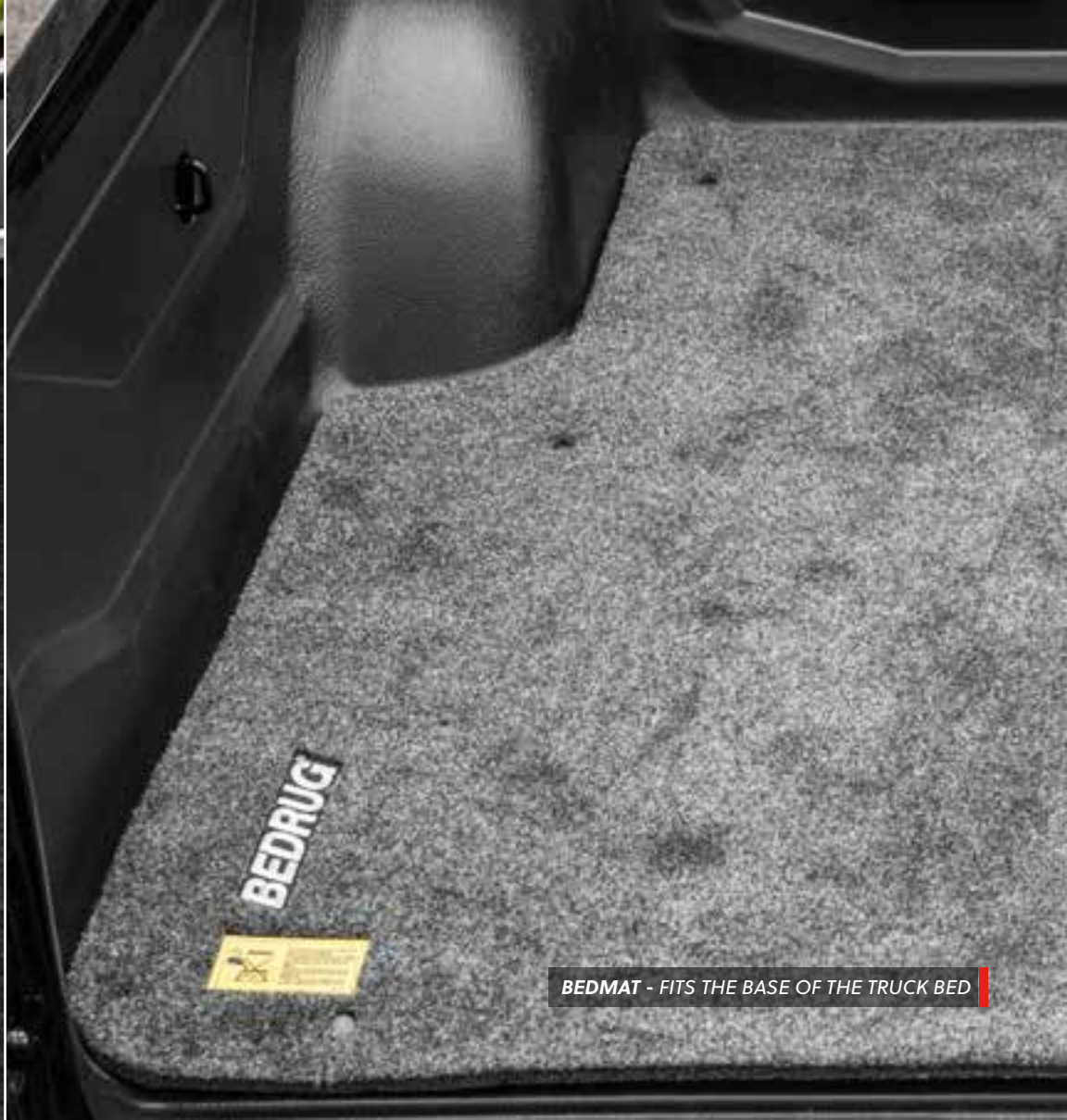
BEDMAT - FITS THE BASE OF THE TRUCK BED